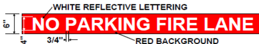
Figure D103.7 Fire Lane Striping. Add a new Figure D103.7. Fire Lane Striping. As follows:

Section D103.8 Signage. Add a new Section D103.8 to read as follows: “D103.8. Signage. When signage is used to identify fire lanes, the signage shall comply with this Section and Figure D103.8 or as approved otherwise. Signage shall be permanent, bearing the words “NO PARKING FIRE LANE”. Signage shall have a white background with red letters and borders using not less than two inch lettering and have a minimum dimension of 12 inches wide by eighteen 18 inches high. Signage shall provide directional arrows as applicable unless otherwise permitted. Signage shall be posted on one or both sides of the fire lane as required by Section D103.6. Signage shall indicate the beginning and ending of the fire lane and shall be spaced no more than 100 feet apart. Additional signage may be required at changes in roadway direction. Signage may be installed on permanent buildings or walls in an approved manner or as approved by the fire code official. Signage shall meet applicable requirements of the Federal Highway Administrations Manual on Uniform Traffic Control Devices (MUTCD).”